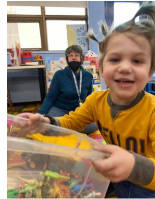
CRAZY HAIR DAY