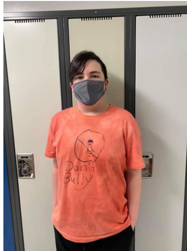
Pink Shirt Day